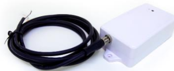
AT1-H Hardwire Rechargeable Device