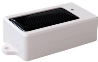
AT1-S Solar Rechargeable Battery Device